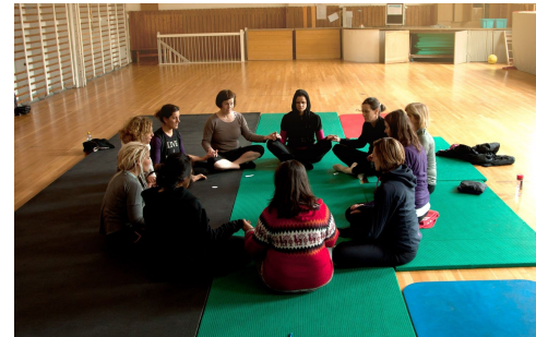
Photos from QiYo Yoga, Yoga and movement workshops in different cities of Spain and Norway 2016