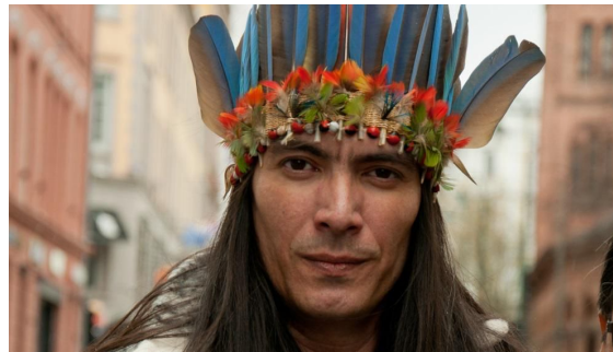
Help Ecuador Action - video interview and support campaign for Earthquake victims, Oslo, Norway 2016