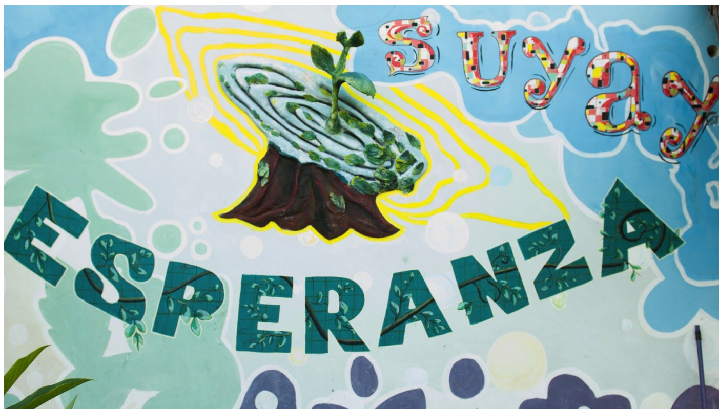
4. and 5. Suyay NGO in Iquitos