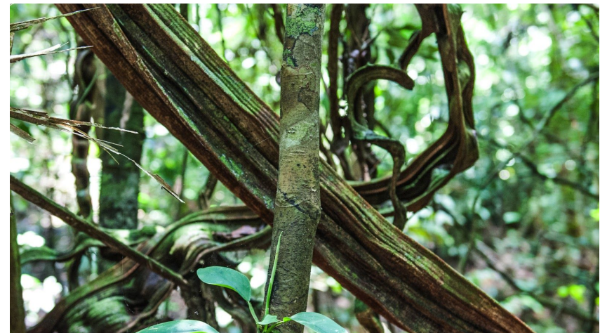
6. Market in Iquitos - 7. Amazon jungle