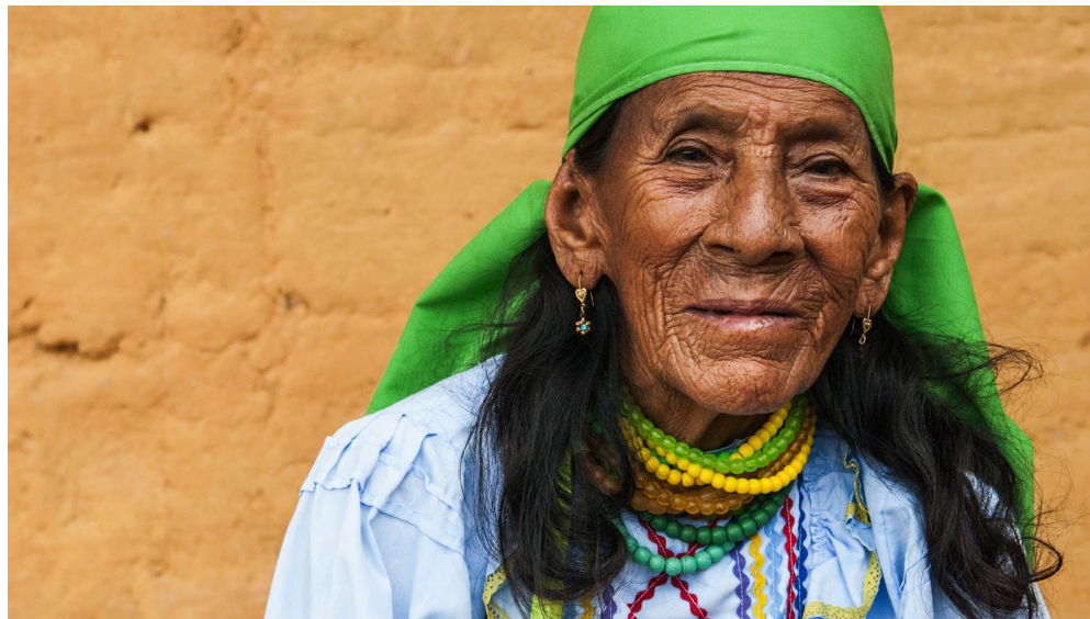
10. Grandmother from Kwechua-Wayku municipality in Lamas, Tarapoto