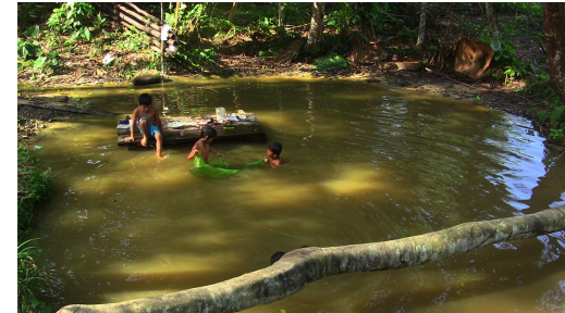
1. Temple of the Moon in Cusco - 2. Urubamba Sacred Valley - 3. Huitoto-Muroy tribe in Amazonas