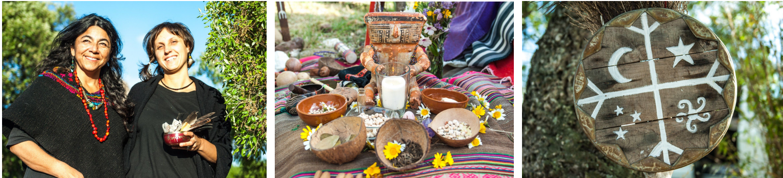
Temazcal ceremony with Flavia from Chile in Cádiz, Spain 2016