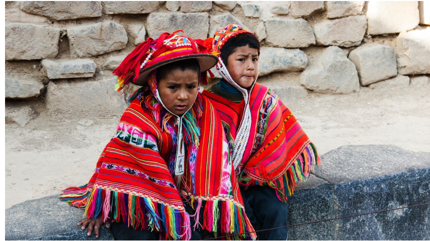
4. Coca leaves - 5. Children with regional costumes at Ollantaytambo